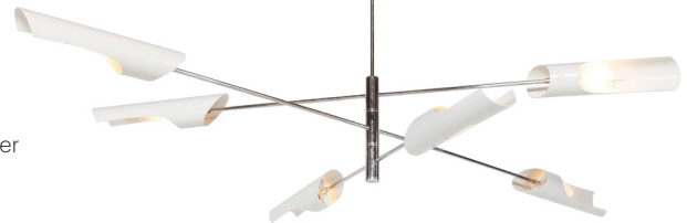
Shown above with three tiers